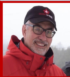
Changing of the Guard